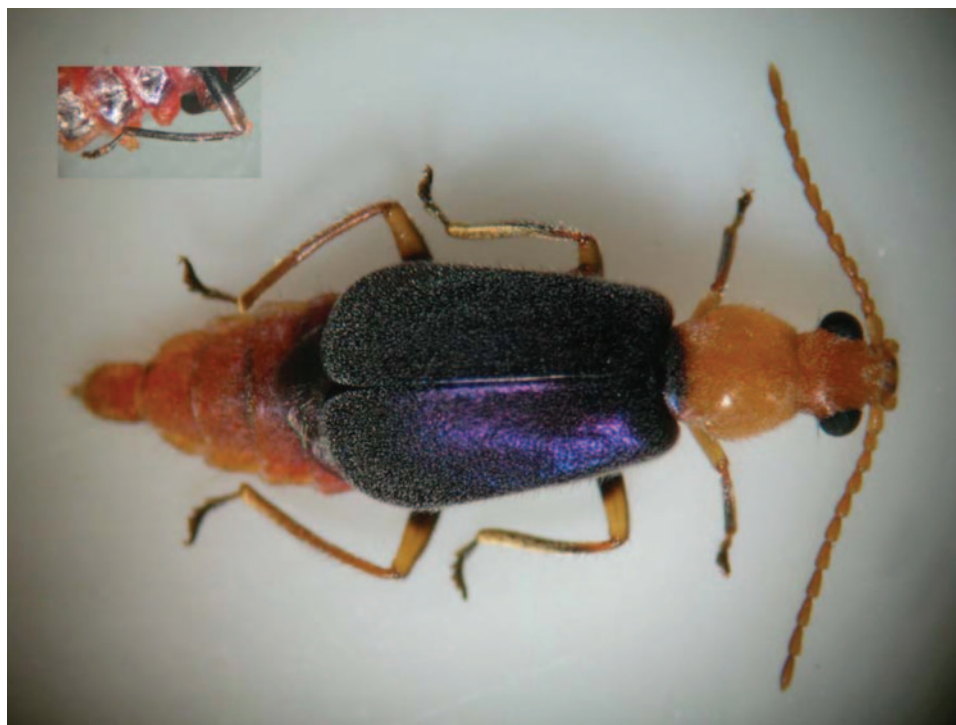
Fig. 2. A. C. pulchra beetle with an insert showing vesicles.

symbionts (19). The possible role of symbionts in the production of beetle BTXs is being investigated.